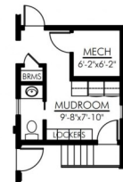
CRAWLSPACE OPTION MARQUIS - 2513

sales@verticalworksinc.com P:414.762.0950 | F:414.762.0955