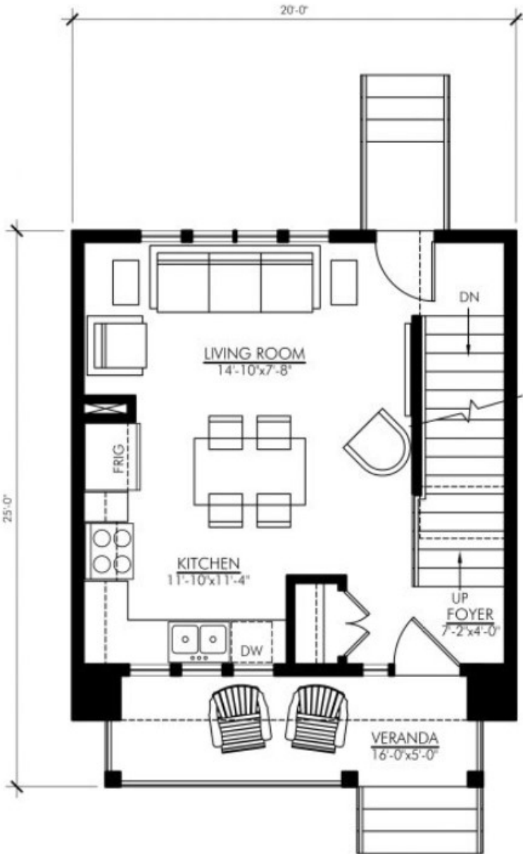
MAIN FLOOR PLAN - 400 SQ FT ALEXANDER - 840